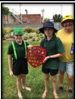
Standen Shield Winners Kingsford