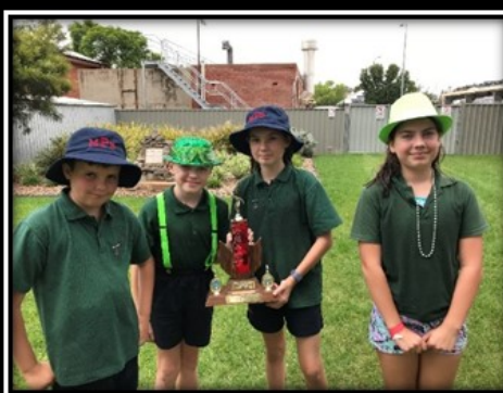
House Competition Winners Kingsford