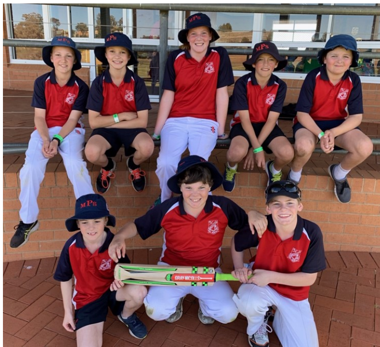
Stage 3 Cricket Gala Day