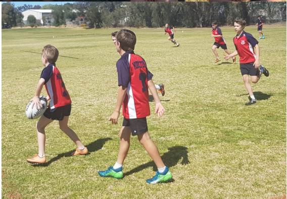
Touch Football Gala Day